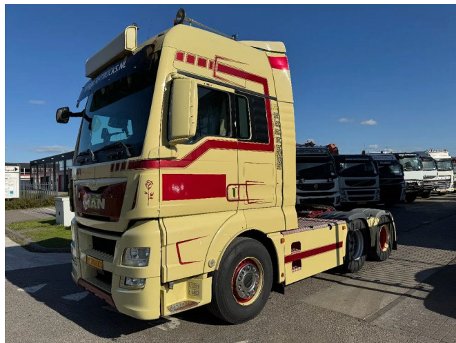
MAN TGX 28.500 6X2 EURO 6 HYDRAULIC SPECIAL INTE... Referentienummer: MA085212