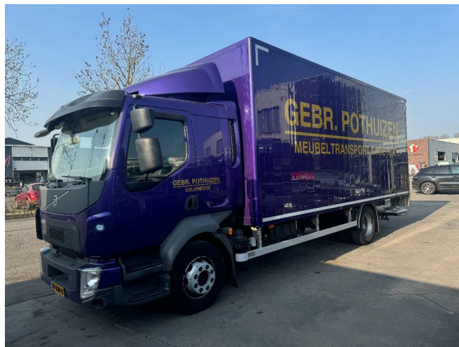
Volvo FL 250 4X2 EURO 6 BOX DHOLLANDIA 1500 KG