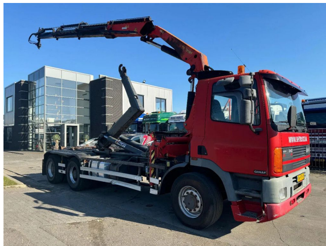
Ginaf M 3232 S 6X2 - EURO 2 + PALFINGER PK19000 + R...