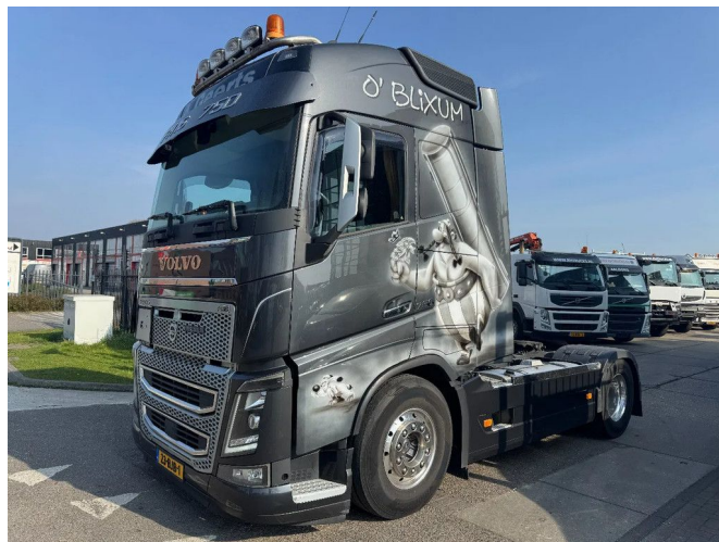
Volvo FH 16.750 4X2 - EURO 6 + SPECIAL PAINT + TÜV 01-...