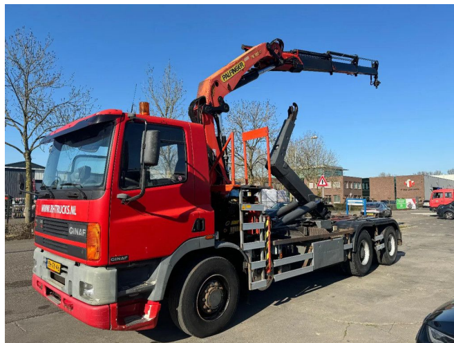
Ginaf M 3232 S 6X2 - EURO 2 + PALFINGER PK19000 + R...