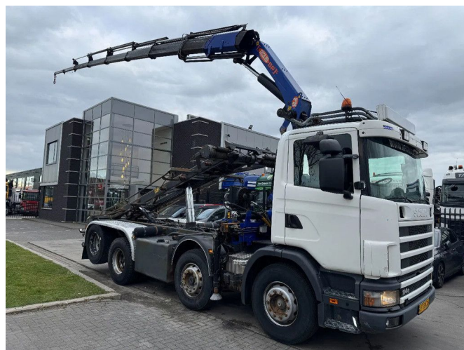
Scania R114-380 8X2 - EURO 3 + PM 23525SP LC 2013! + ...