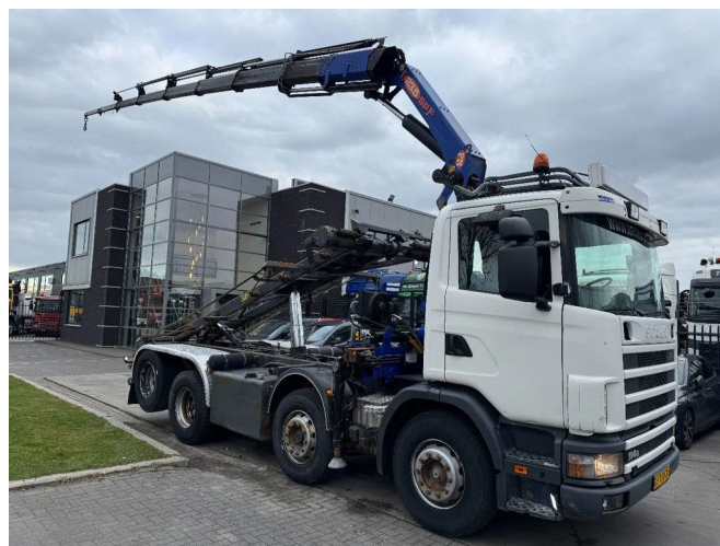
Scania R114-380 8X2 - EURO 3 + PM 23525SP LC 2013! + ...