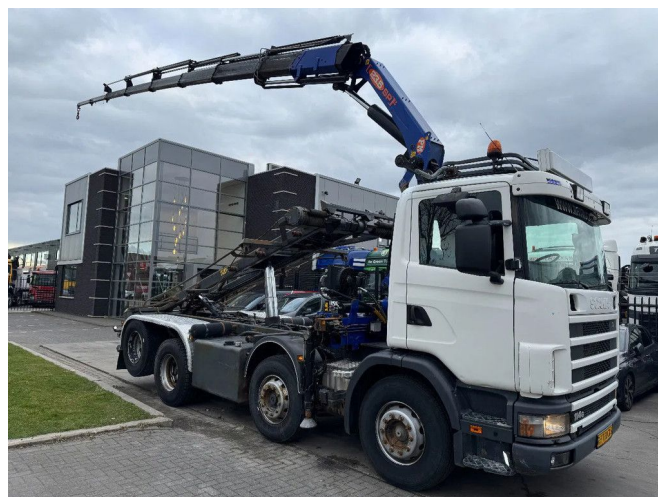
Scania R114-380 8X2 - EURO 3 + PM 23525SP LC 2013! + ...