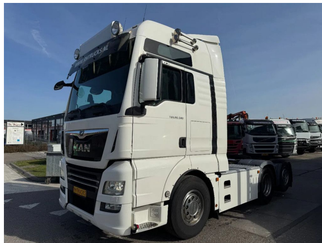
MAN TGX 26.500 6X2 - EURO 6 + LIFTING AXLE