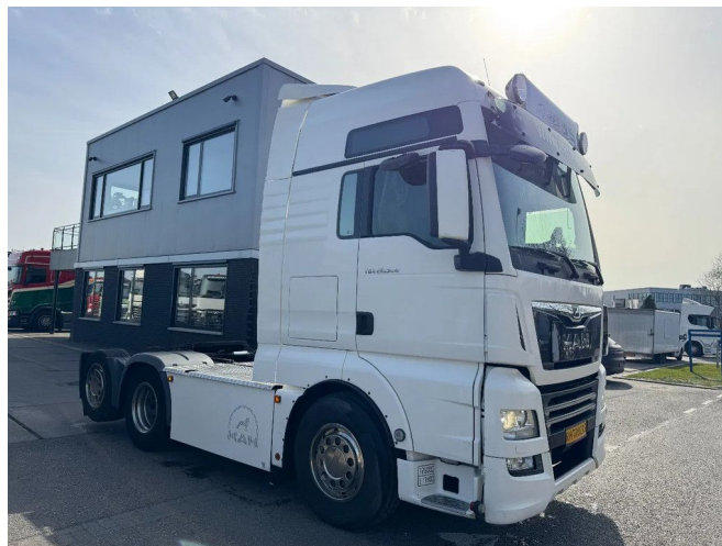
MAN TGX 26.500 6X2 - EURO 6 + LIFTING AXLE