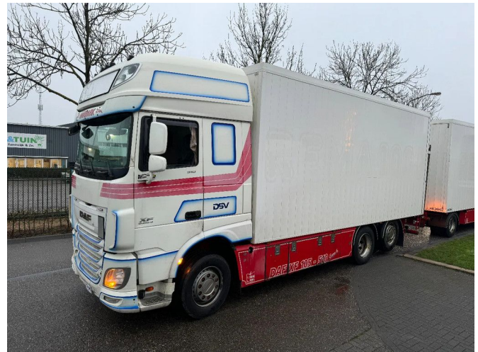
DAF XF 510 6X2 - EURO 6 + RETARDER + ZEPRO LIFT + ...