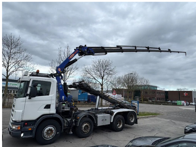
Scania R114-380 8X2 - EURO 3 + PM 23525SP LC 2013! + ...