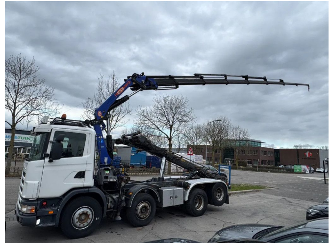
Scania R114-380 8X2 - EURO 3 + PM 23525SP LC 2013! + ...