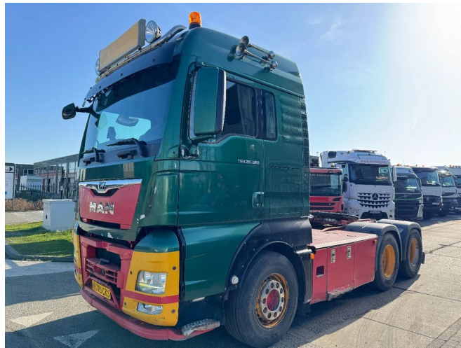
MAN TGX 26.500 6X4 - EURO 6 + KIPPER HYDRAULIC