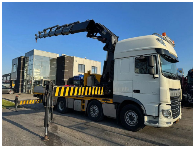
DAF XF 460 8X2 - EURO 6 + HIAB 855 EP-6 + REMOTE + S...