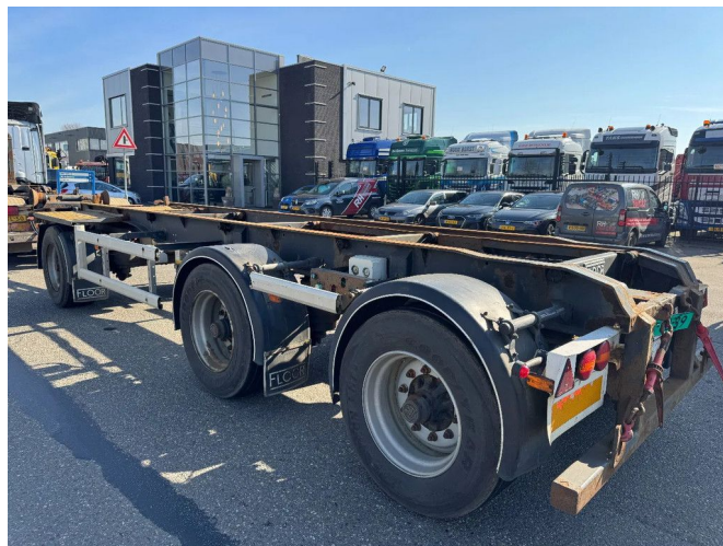
Floor FLA-10-20 - 3 AXLE BPW