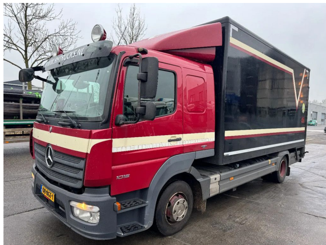
Mercedes-Benz Atego 1016 4X2 - EURO 6 + DHOLLANDIA LIFT