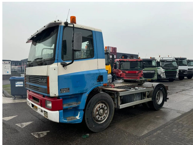
DAF CF 75.250 4X2 EURO 2 MANUAL GEAR 6 TYRE HYD...