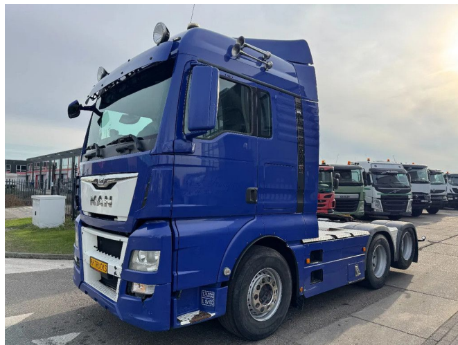
MAN TGX 28.480 6X2 - EURO 6 + KIPPER HYDRAULICS + ...