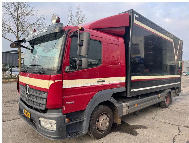
Mercedes-Benz Atego 1016 4X2 - EURO 6 + DHOLLANDIA LIFT