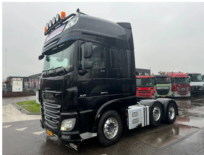
DAF XF 530 6X2 EURO 6 RETARDER HYDRAULIC TÜV TIL...