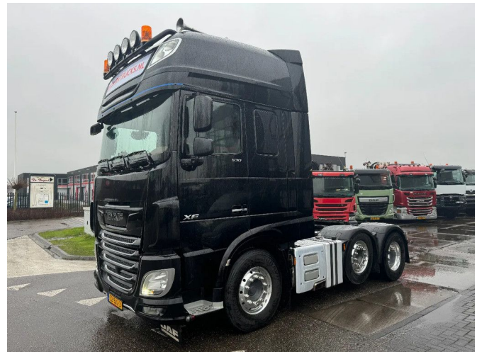
DAF XF 530 6X2 EURO 6 RETARDER HYDRAULIC TÜV TIL...