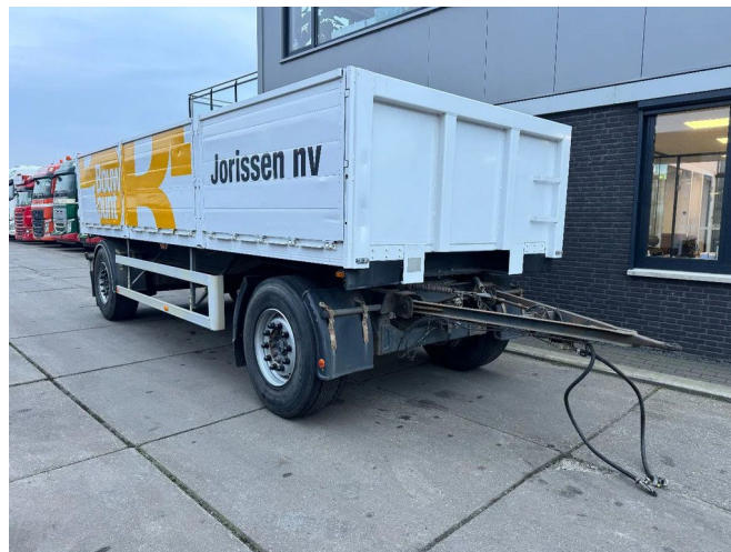
ATM 2 AS SCHAMEL + LAADBAK 6,50 METER