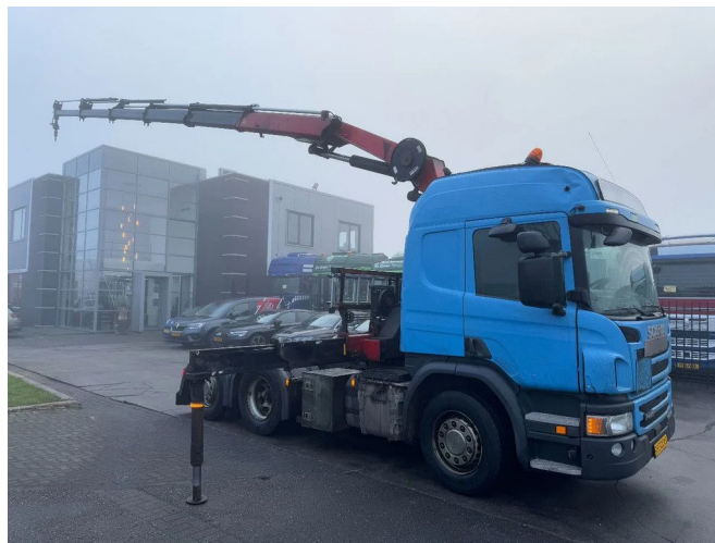
Scania P450 6X2 - EURO 6 + HMF 2620-K5 + REMOTE + LI...