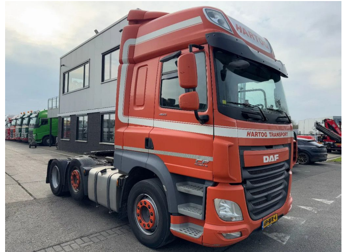
DAF CF 460 6X2 - EURO 6 + LIFT/STEERING AXLE