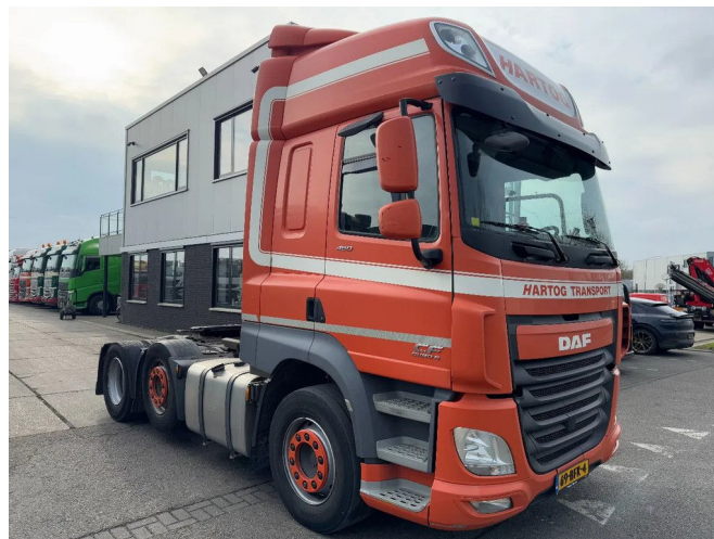
DAF CF 460 6X2 - EURO 6 + LIFT/STEERING AXLE