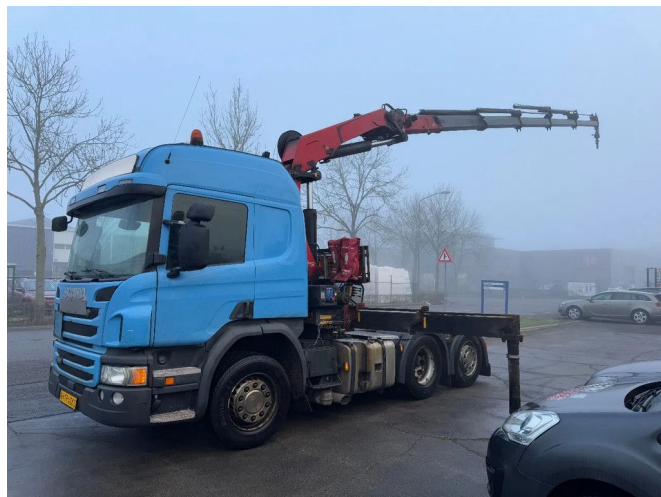
Scania P450 6X2 - EURO 6 + HMF 2620-K5 + REMOTE + LI...