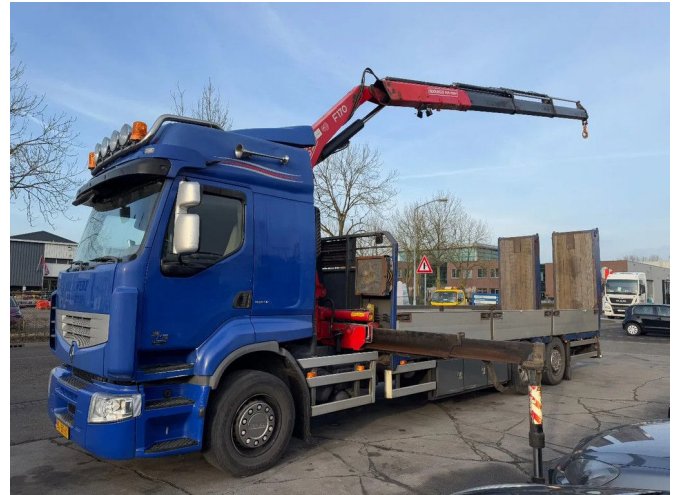
Renault Premium 370 6X2 - EURO 5 + FASSI F170A 23 + R...