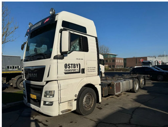
MAN TGX 26.500 6X2 EURO 6 BDF SYSTEM FULL AIR