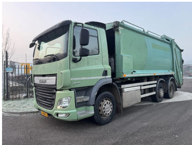
DAF CF 290 6X2 DENNIS EAGLE EURO 6