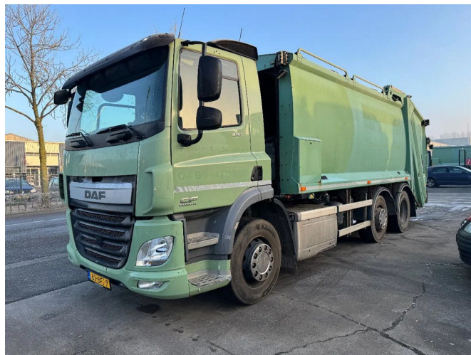
DAF CF 290 6X2 EURO 6 DENNIS EAGLE OLYMPUS 21W