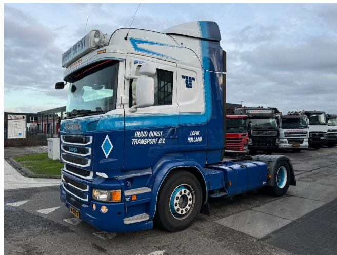
Scania R410 4X2 EURO 6 SPECIAL INTERIOR