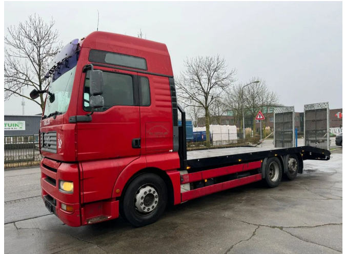
MAN TGA 26.440 6X2 - EURO 5 + MANUAL GEAR