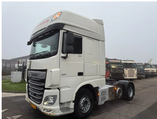
DAF XF 450 6X2 - EURO 6 + LIFT/STEERING AXLE