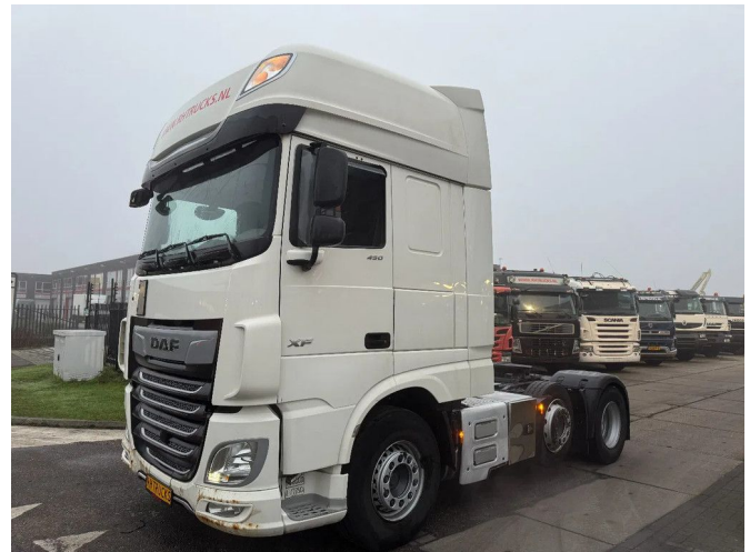
DAF XF 450 6X2 - EURO 6 + LIFT/STEERING AXLE