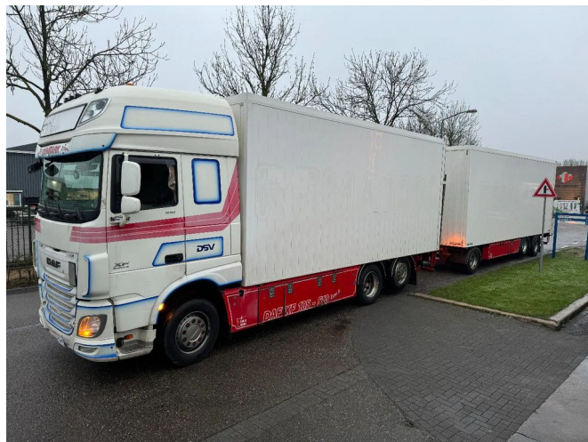
DAF XF 510 6X2 + KELBERG HANGER EURO 6 ZEPRO + ...