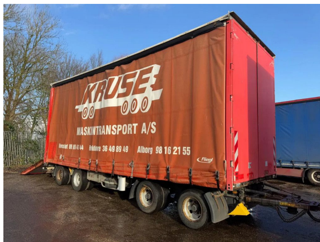
Fliegl VPS 320 HYDRAULIC RAMP 3,15 M 4X BPW AXLE U...