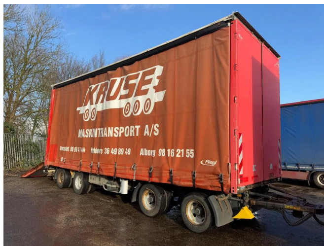
Fliegl VPS 320 HYDRAULIC RAMP 3,15 M 4X BPW AXLE U...