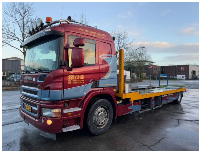
Scania P420 4X2 - EURO 5 + MANUAL GEAR + VBG VANG...