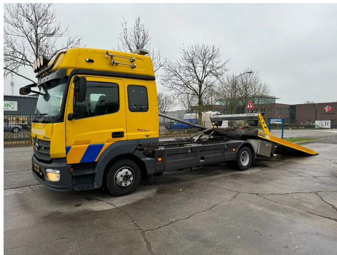
Mercedes-Benz Atego 1224 4X2 - EURO 6 + OMARS SCHUI...