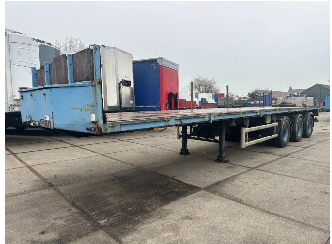
Floor LAST 2 AXLE STEERING, FIRST LIFT AXLE