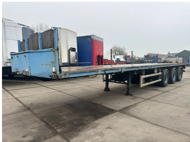
Floor LAST 2 AXLE STEERING, FIRST LIFT AXLE