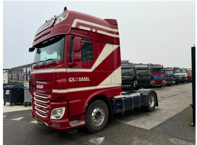
DAF XF 510 4X2 ADR EURO 6 ALCOA TÜV TILL 08-2025