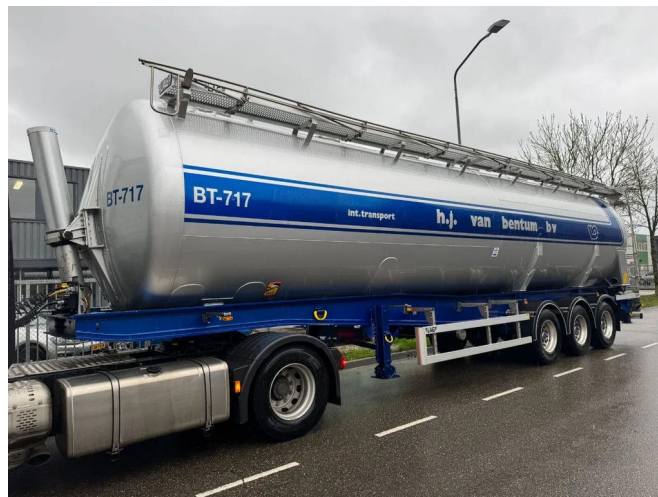
LAG 3 AXLE - KIPPER BULK 1 COMP. 61.000 L - TÜV 10-2025