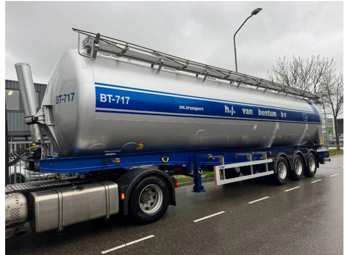
LAG 3 AXLE - KIPPER BULK 1 COMP. 61.000 L - TÜV 10-2025