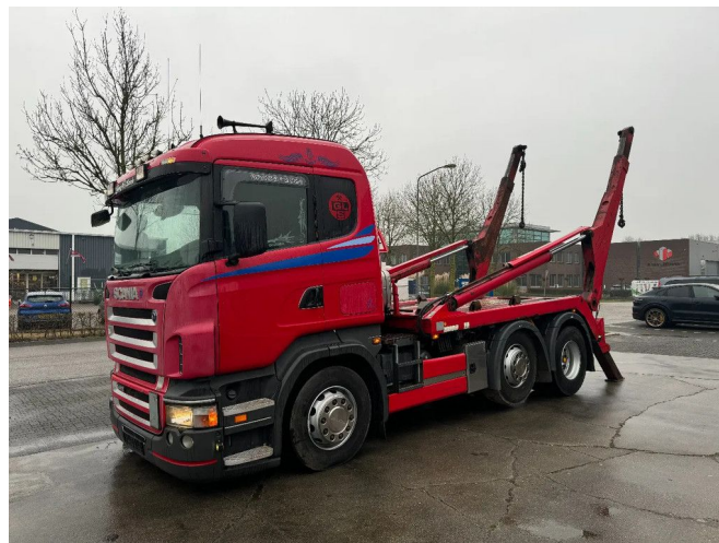
Scania R420 6X2 MULTILIFT SLT 180