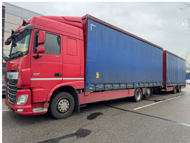
DAF XF 410 6X2 - DRACO MZS 218 HANGER + EURO 6 + L...