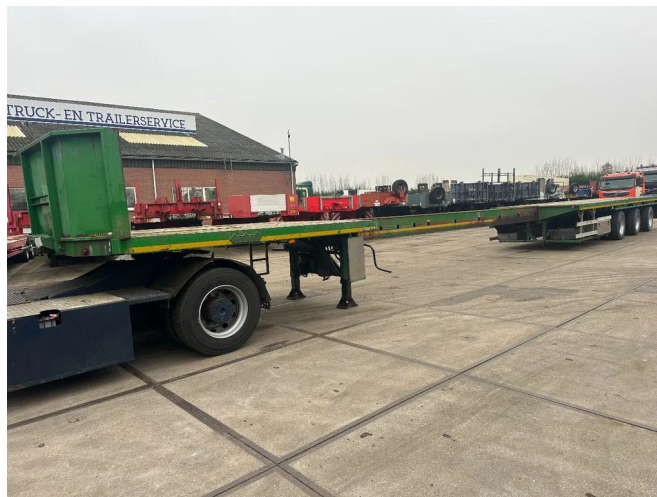
Nootboom GESTUURD, 7,95 METER UITSCHUIFBAAR