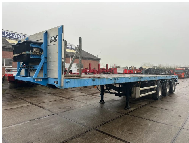
Floor 2 ASSEN GESTUURD