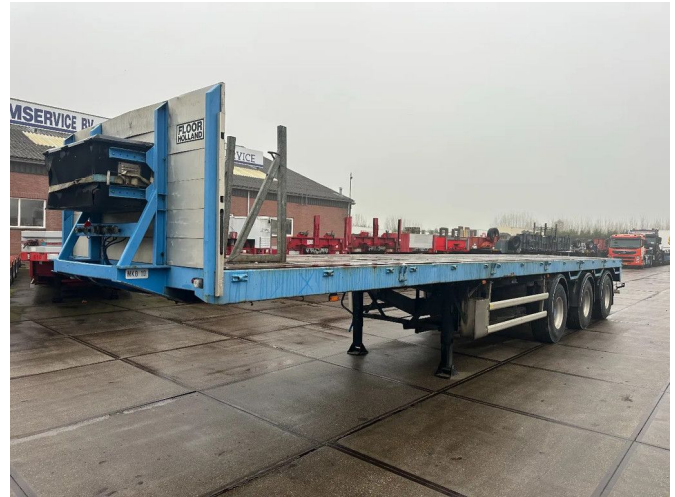
Floor 2 ASSEN GESTUURD